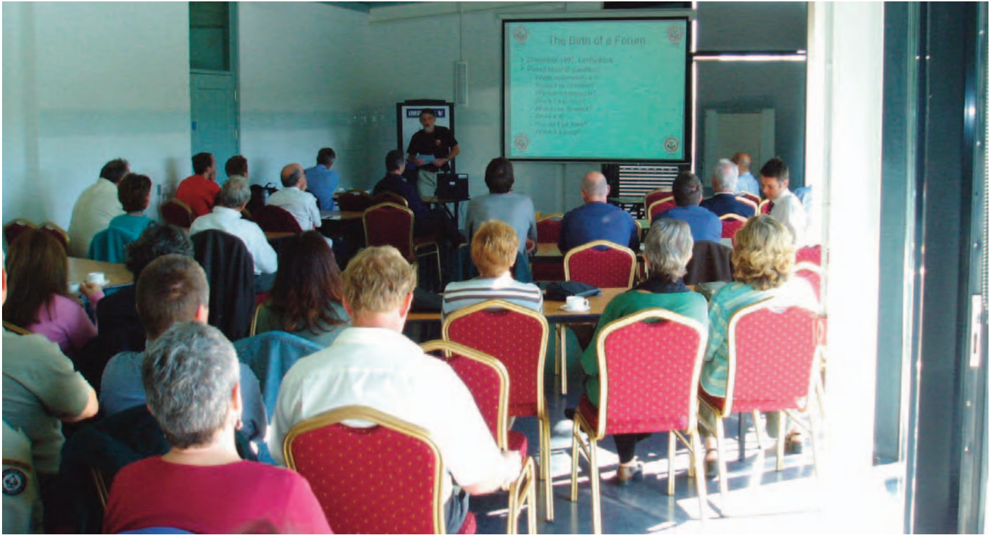
Photo1: Delegates listening to one of the presentations during the event.