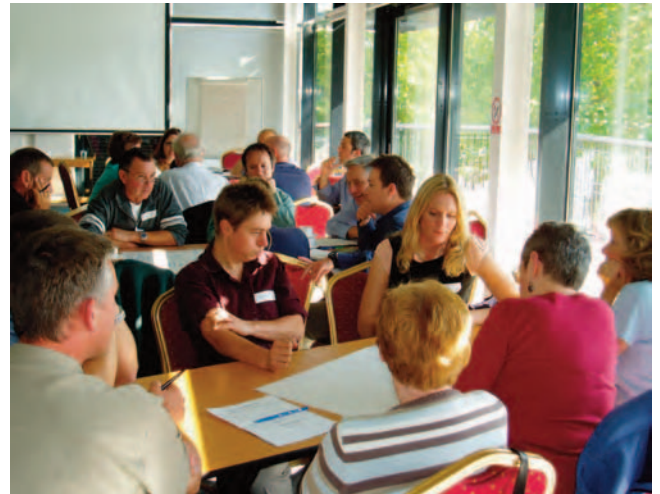
Photo 4 and 5 show some of the groups discussing the establishment of a forum