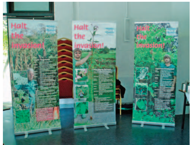
Photo 2 and 3 show some of the displays of information put together for the event