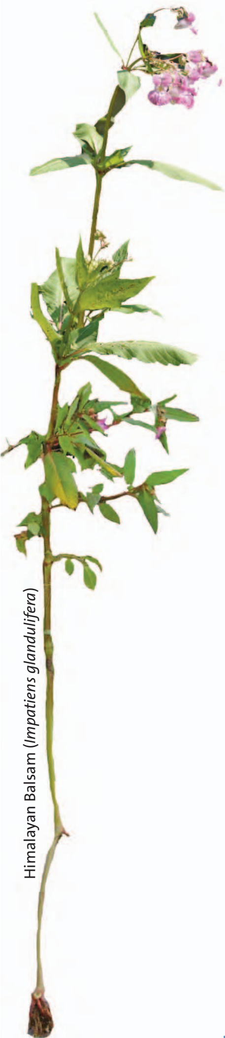
Himalayan Balsam ( Impatiens glandulifera )